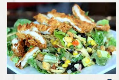
Southwest Salad* 10.75 Crispy chicken breast over a bed of Romaine lettuce, corn, black beans, tortilla strips, pico de gallo, and Parmesan cheese.

Grilled Chicken Sandwich* 9.75 Grilled Chicken breast with cheese, lettuce, tomato and myo on a toasted brioche bun.