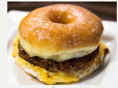
Peña's Donut Sandwich* 5.25 😭 Egg, sausage patty and a slice of American cheese on a Peña's glazed donut.